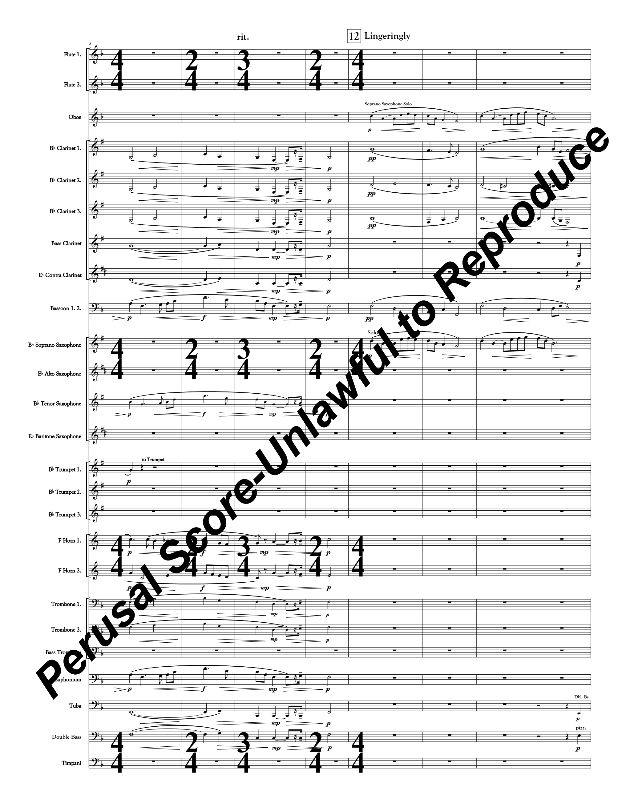
Melody from "Colonial Song"